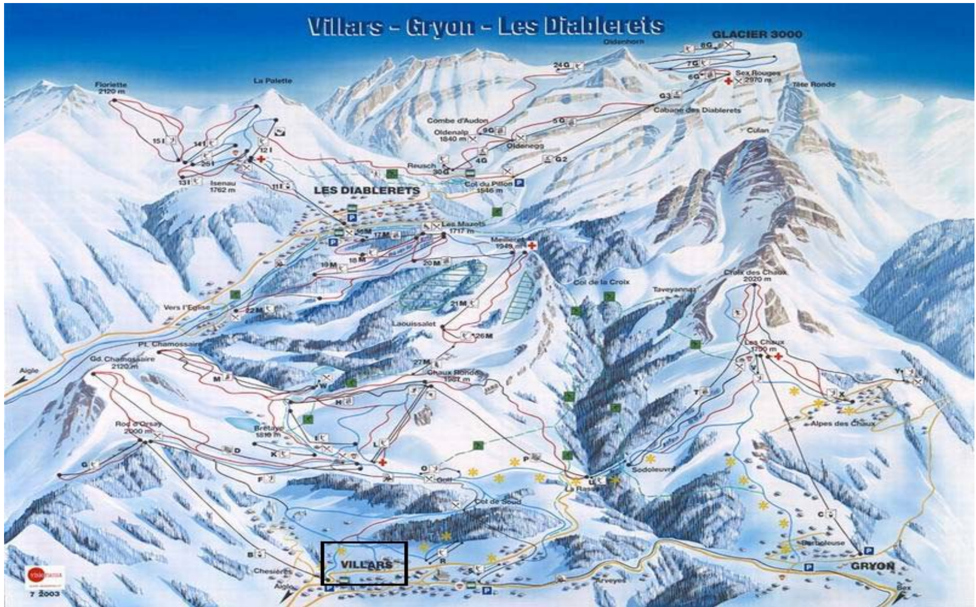
Villars – 220km of pistes and modern lifts

Simon Malster +44(0) 20 8905 5511 simon@investorsinproperty.com