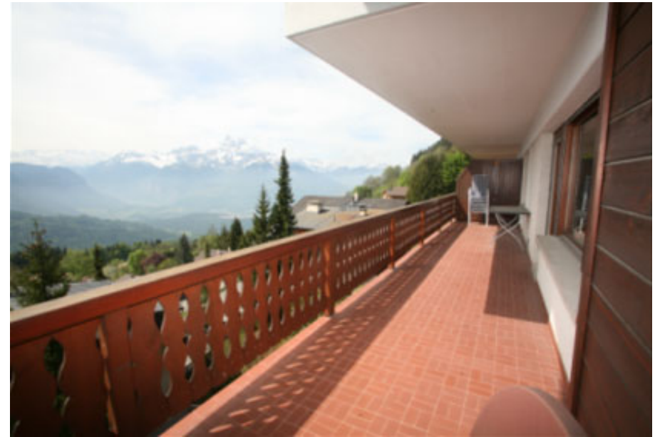
Further pictures of the 4 bedroom apartment and the studio apartment (bottom right)