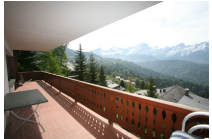
Stunning views from these apartments

Click here to view the full description of the resort